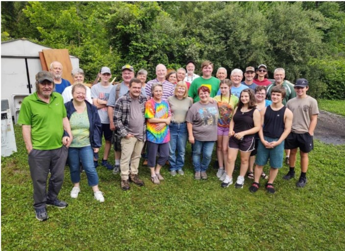
Picture of Zion June 2023 work camp. Those who helped and the families we helped.

It is not too late to sign up for Zion's 2024 work camp at Henderson Settlement! We have room for you and would love to have you come with us! Don't miss this opportunity to enjoy beautiful Frakes Kentucky while at the same time helping families in need. Most of all I guarantee it will be an enjoyable time of fun and fellowship. We already have 14 people signed up to go and we have room for many more! No matter what your skill set is, there are things you can do to help. The cost is $350, and this includes your room and meals for the entire week. We will be selecting a community project on or around the first of March, so it will be helpful to know who is coming and how many are coming. The dates are Sunday June 9 through Saturday June 15th. You also can come part of the week that works for you. One half of the registration fee is due March 15th. You can make your check to Kokomo Zion church and in the memo line include Henderson 24 Work Camp Registration. We will leave church on Sunday June 9 right after church and plan to be at Henderson Settlement in time for Sunday dinner.